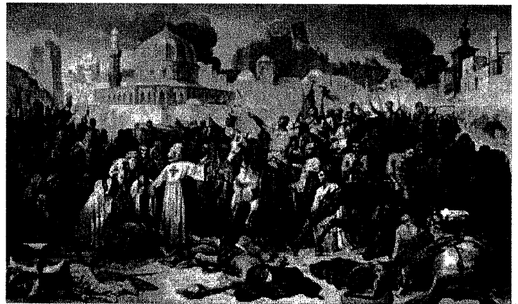
Artwork depicting the "triumphant" siege of Jerusalem during the 1st Crusade

5. The First Crusade The first crusade, which is considered by many to be the only successful crusade, lasted from 1095-1099, established the Latin Kingdom of Jerusalem, providing more lands for the crusading knights, who often travelled across Europe to try their fortunes and to visit the Holy Sepulchre.